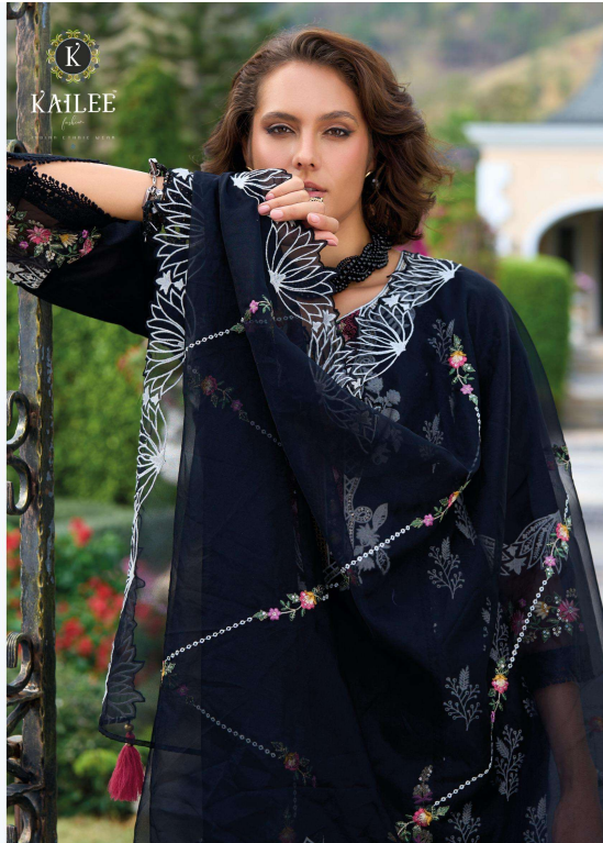
Style and sophistication