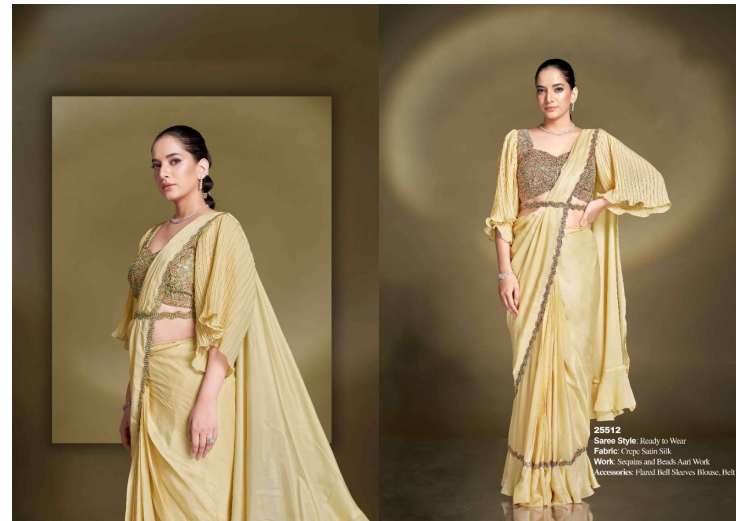
25512 Saree Style: Ready to Wear Fabric: Crisp, Satin Silk Work: Sequins and Beads Anti Work Accessories: Flared Bell Sleeves Blouse, Belt