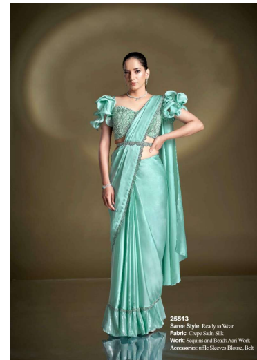
25513 Saree Style: Ready to Wear Fabric: Crepe Satin Silk Work: Sequins and Beads Aari Work Accessories: title Sleeves Blouse, Ick