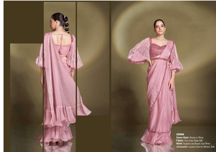
25506 Saree Style: Ready to Wear Fabric: Two Tone Satin Silk Work: Sequins and Beads Aari Work Accessories: Latitan Sleeves Blouse, Belt