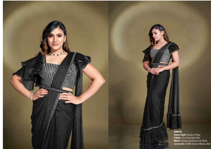
25510 Saree Style: Ready to Wear Fabric: Two Tone Satin Silk Work: Sequins and Beads Applique Accessories: Bangle, Shree Bhoot, Bell