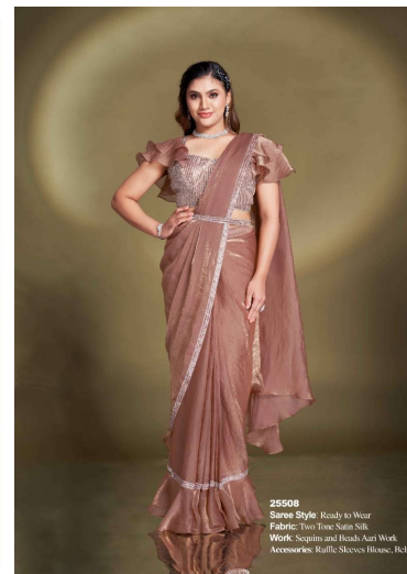
25508 Saree Style: Ready to Wear Fabric: Two Tone Satin Silk Work: Sequins and Beads/Kari Work Accessories: Ruffled Sleeves Blouse, Belt