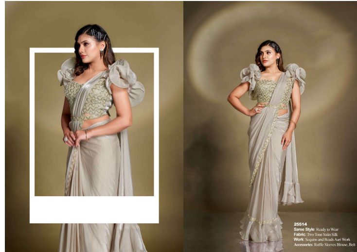
25514 Saree Style: Ready to Wear Fabric: Two Tone Satin Silk Work: Sequins and Black Aari Work Accessories: Ruffle Sleeves Blouse, Belt