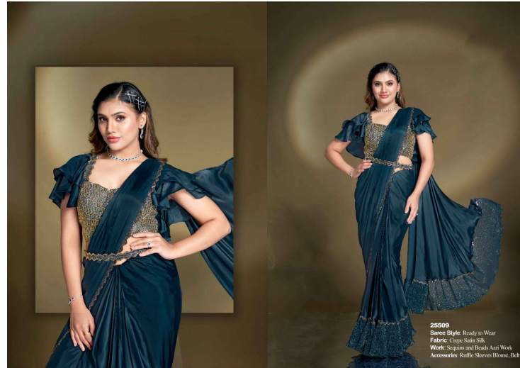
25509 Saree Style: Ready to Wear Fabric: Crepe Satin Silk Work: Sequins and Beads Aari Work Accessories: Ruffle Sleeves Blouse, Belt