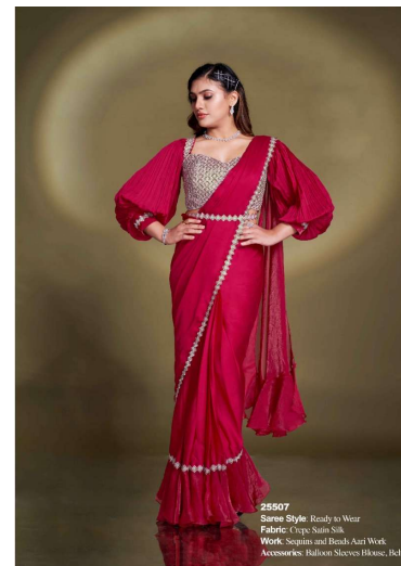
25507 Saree Style: Ready to Wear Fabric: Crepe Satin Silk Work: Sequins and Beads/Art Work Accessories: Fullon Sleeves Blouse, Belt