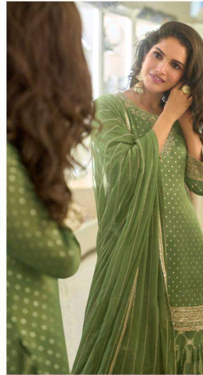
TRIBAL TRENDS Style is the poetry of appearance, written in fabric and form.